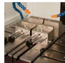
60 CT501 00