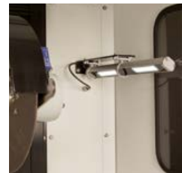
Work area lit by LED strip