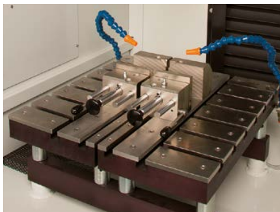
A spacious cutting chamber: W 408 x D 422 mm with openings on both right and left sides for the cutting of long samples.