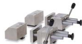
60 CT400 20